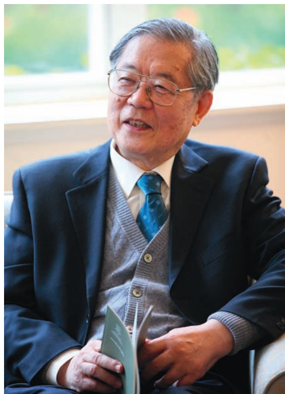
Professor Zhou Guangzhao 周光召教授

“We are extremely honoured that such a prominent scientist and scholar as Zhou Guangzhao joins us today, and that the foundation that carries his namesake grants us this Endowed Professorship,” said Professor Lap-Chee Tsui, Vice-Chancellor of The University of Hong Kong. “We are proud that we have 54 Endowed Professorships and we are aiming at creating 100 Endowed Professorships, and I am gratified that we are moving towards our goal.”