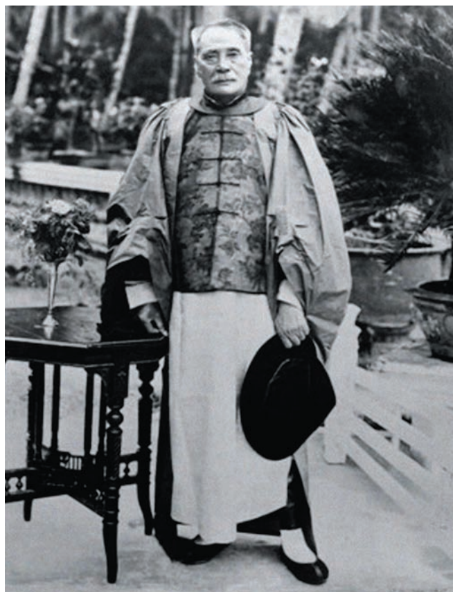
Loke Yew, wearing his academic gown in 1916 穿著學術袍的陸佑

港大建於1910年。屬港大建築象徵的大禮堂，1956年正式命名為陸佑堂，在此典雅的大樓內，曾舉辦無數重要慶典及學生活動。陸佑堂座落於本部大樓，大樓亦於1984年被列為歷史建築。