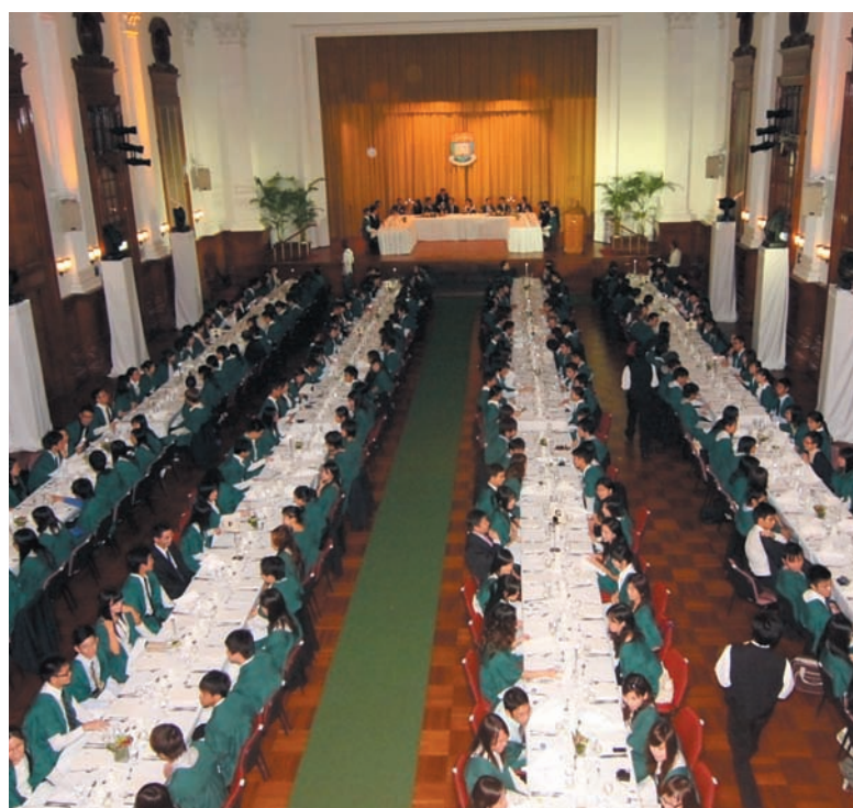
Loke Yew Hall 陸佑堂

On a quiet day on campus, the sound of music echoes through the rotunda of the Hung Hing Ying Building on HKU's Main Campus. The building, which stands out with its Edwardian-styled architecture, has housed the Department of Music since 1996.