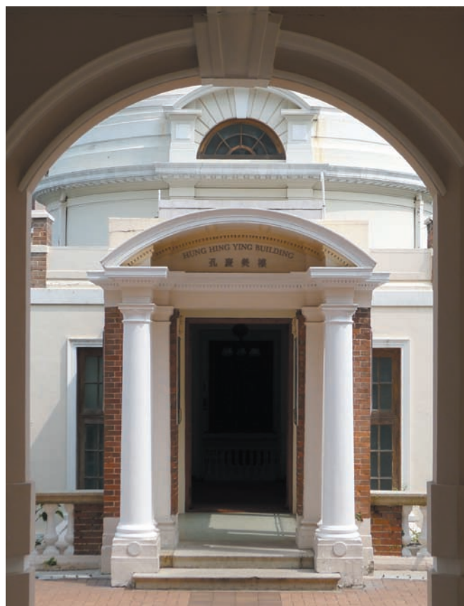
Hung Hing-Ying Building 孔慶熒樓